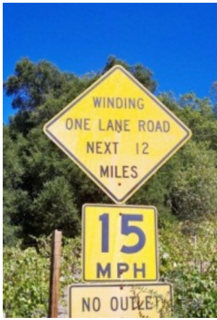
This sign means a 12 mile climb for no reason as the road dead-ends (you just come back down). Ian did this one; I bailed at 4 miles up. Fast and fun decent back down.