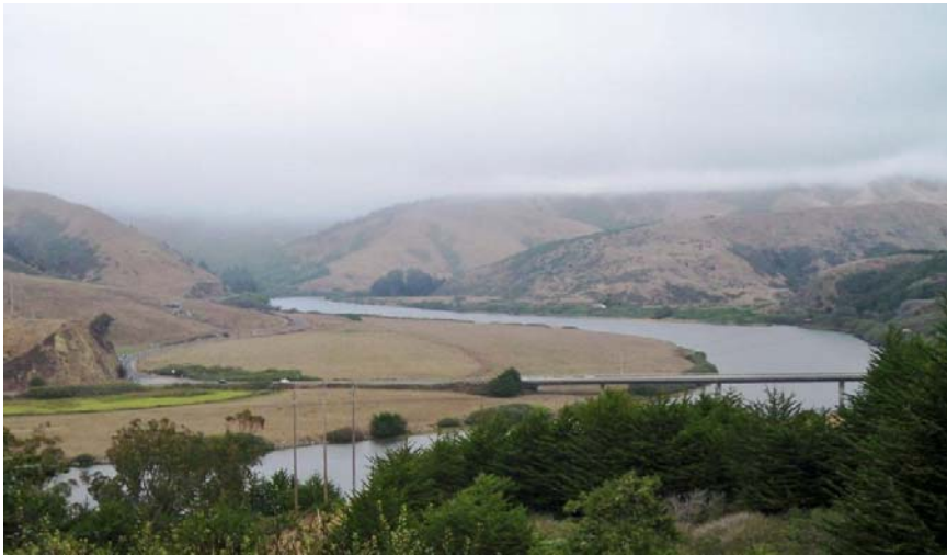
Our route followed the Russian River to the ocean and across this bridge onto Highway 1 along the coast.