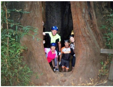
Giant redwoods (look very closely, there is a guy walking on the trail) We hang out in a tree.