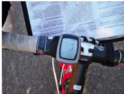
My speedometer as I climb a couple of miles up the 'short-cut'. Yes that 3 MPH while riding up a 20% grade (who makes a road a 20% grade?).