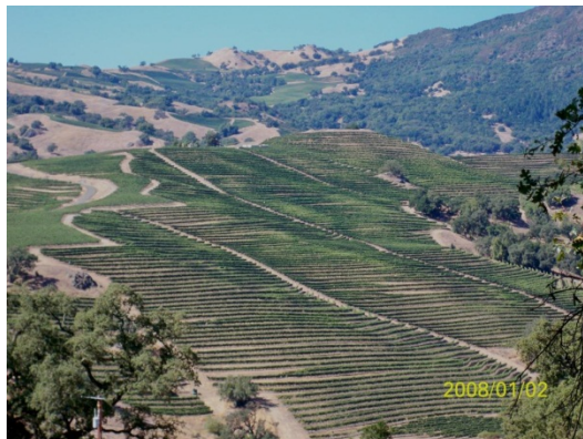
They seem to grow grapes everywhere (for some reason my camera thinks it is 2008).