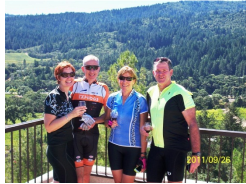
Pulling off the planned route for a tasting. The view from Sterling vineyards.