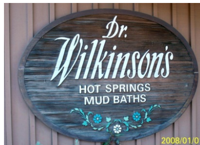
Lessons in flat repair, lessons in drinking a flat at a brew pub and lessons in lying flat in a mud bath.