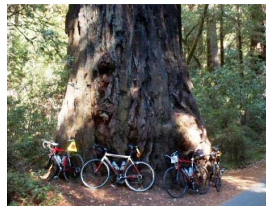
Back to the main road and Armstrong State Redwood Park where the girls await us (after all we took the 'short cut').