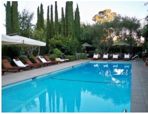
1 st class hoteling after a day on the road.