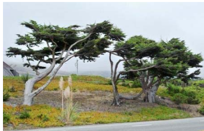
and windswept trees.