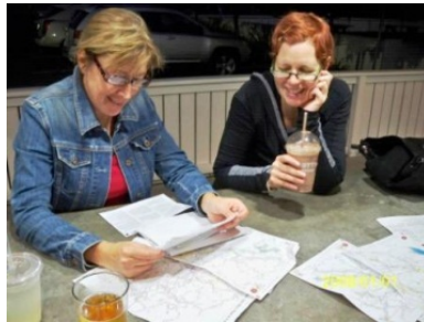
Nightly route planning was important!