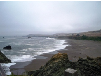
a Pacific Beach