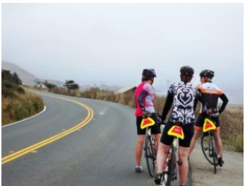
The Coastal Road