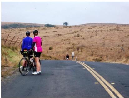
Marin County is rolling empty hills. Climbing up some Cliff road in Marin County.